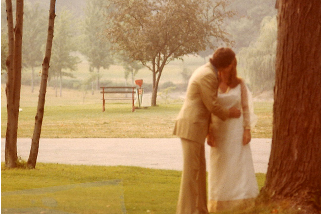
August 18, 1973. During the wedding reception at the Chikaming Club, the blessed couple celebrated on the golf course, though they have never actually played golf.